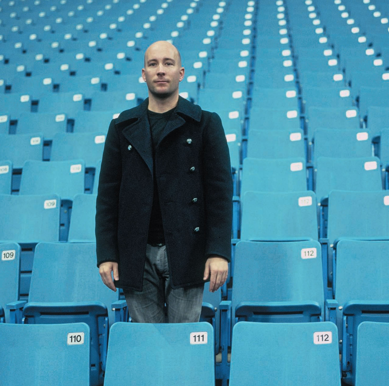
Antonia Hirsch, Vox Pop , 2008, production still, courtesy of the artist, photo Photo Technic